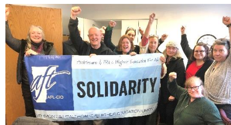
Fun times at the Delegate Assembly

together to promote the value of our colleges and highlight the benefits of higher education to the people who make decisions in Montpelier.